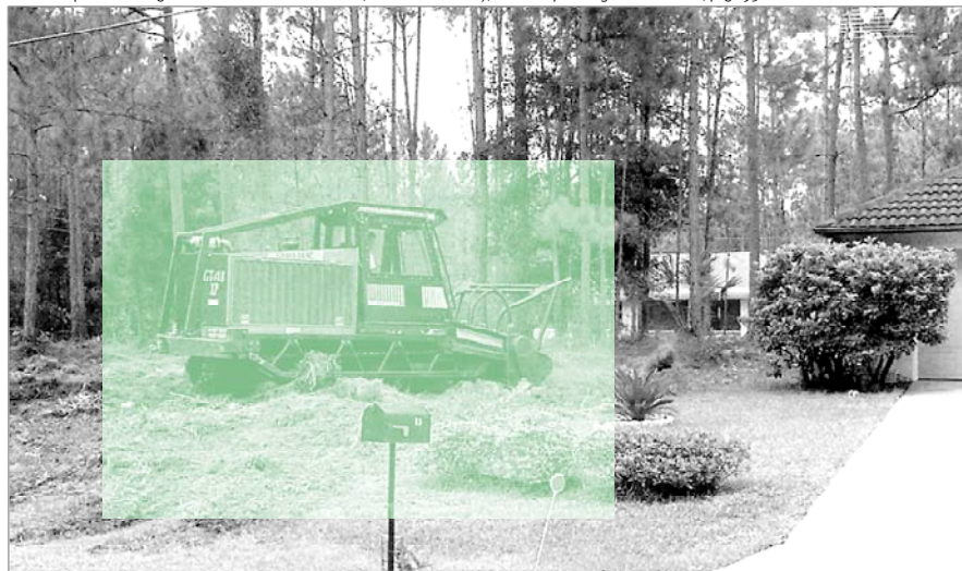
➡ This Gyratractor is removing heavy fuels in an undeveloped lot in the Palm Coast subdivision in Flagler County, Florida.

Florida Department of Agriculture and Consumer Services, Division of Forestry, from Wildfire Mitigation in Florida , page 93.