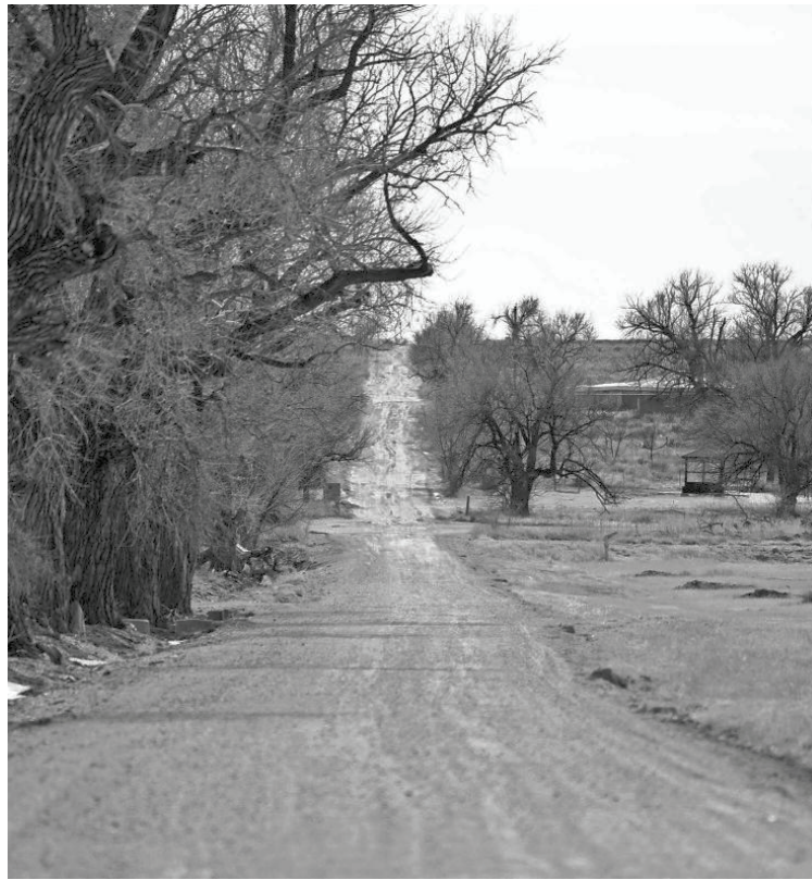
A dirt road leads up to the Amache National Historic Site in southeastern Colorado. This view was similar to what arriving detainees would have seen as they were driven under armed guard from the nearby train tracks to what, at the time, was Colorado's 10th-largest city, housing 7,500 Japanese Americans during World War II.

"We have to be able to confront those stories and interpret them and put them in front of future generations so that they understand all of the chapters of our nation's history" she said. "Black history is American history. Native American his-