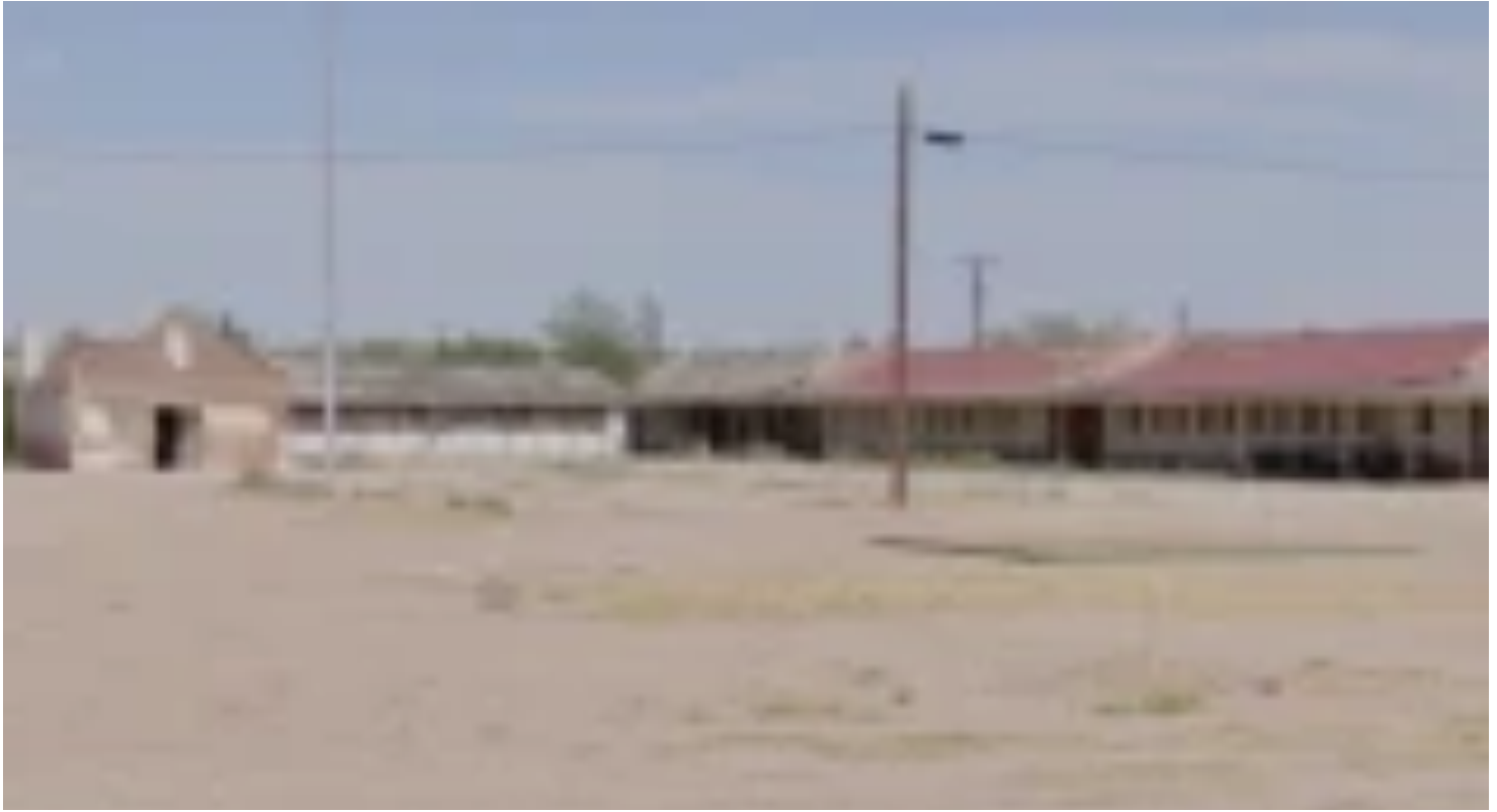
Rio Vista Farm in Socorro