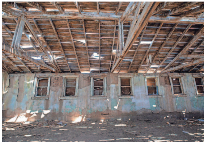
With its new historic landmark designation, Rio Vista Farm in Texas became part of a sprawling but quiet effort to reshape how America's past is remembered and shared.