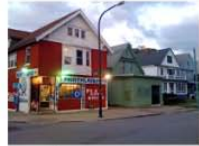
store, houses, and school. mixed-use neighborhood