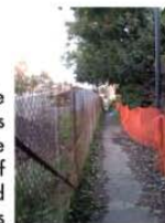
fences create boundaries that indicate separation of public and private spaces