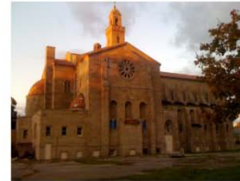
St. Francis deSales, built 1926