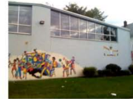
Boys and Girls Club