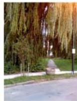
entrance to footpath paths like this enhance 'walkability' of neighborhood