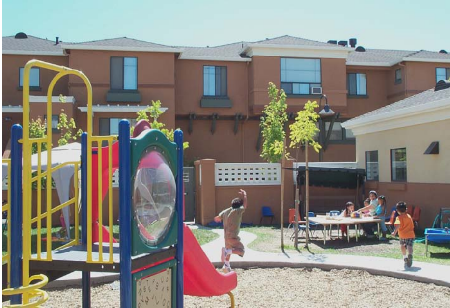
Figure 1. In San Jose, California, the community colocated child care and affordable housing near a light-rail station.