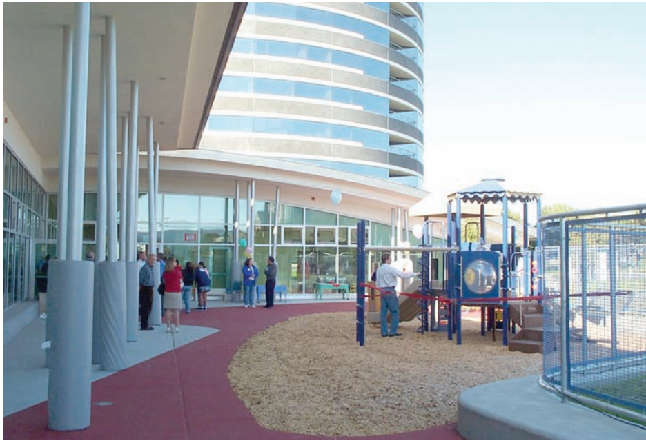
Figure 2. South San Francisco built a child care center in an office park to support the growth of its biotechnology industry.

Federal CDBG funds commonly subsidize child care operations or facility construction and renovation for low-income populations (Anderson 2006). Starting new child care businesses is an eligible economic development activity. San Jose and San Mateo County in California, among others, fund family child care home business development projects that provide training, technical assistance, and start-up resources. Other cities support consortia of family child care providers to help them access economies of scale in purchasing and management. The nonprofit Acre Family Child Care Network in Lowell, Massachusetts, oversees 39 homes that serve an average of 234 children daily (Stoney 2004).