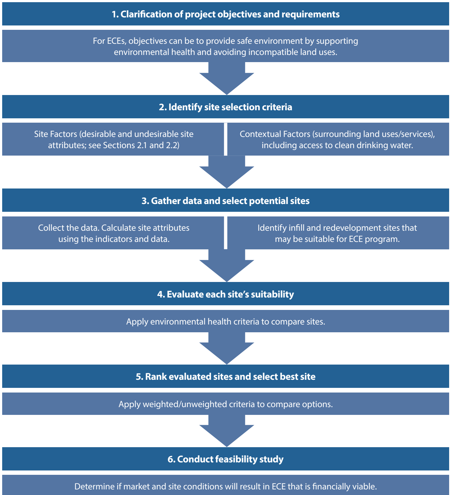
Figure 3. Site selection process, with an emphasis on environmental health and ECE program development. Adapted from LaGro (2013). Copyright © 2013 by John Wiley & Sons, Inc. All rights reserved.