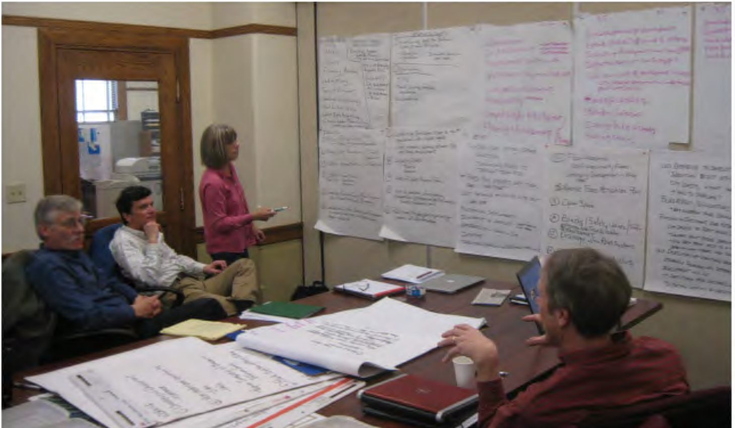
All four CPAT members reviewing notes and discussing major themes of the stakeholder workshop.