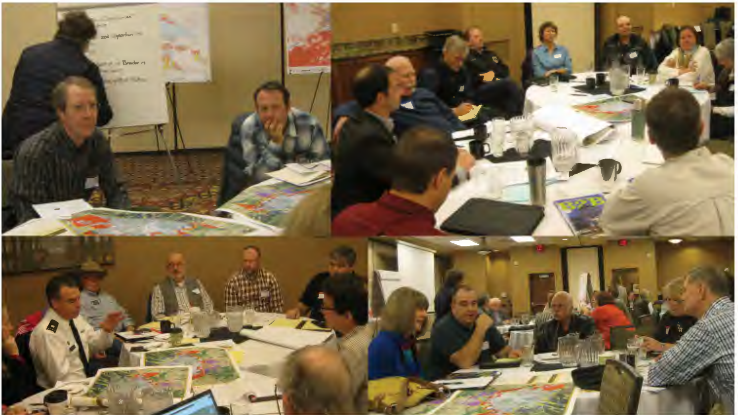
Images 1-4: CPAT members facilitated each of the four groups of stakeholders during the workshop. Each stakeholder group participated in three different discussions organized as: Issues, Goals, and Priorities/Recommendations. Stakeholder views were recorded with the help of City and County planning staff.

The final results of the workshop can be found in the next sections of this report and are organized by issues, goals, and implementation strategies. The team learned that there were common themes and threads that were discussed throughout the four tables and these are highlighted as the big picture topics in the sections that follow. There were also a number of other items that were discussed by stakeholders that are included in Appendix B. These tended to be single issue, vague, or they were already generally covered in the team’s big picture assessments.