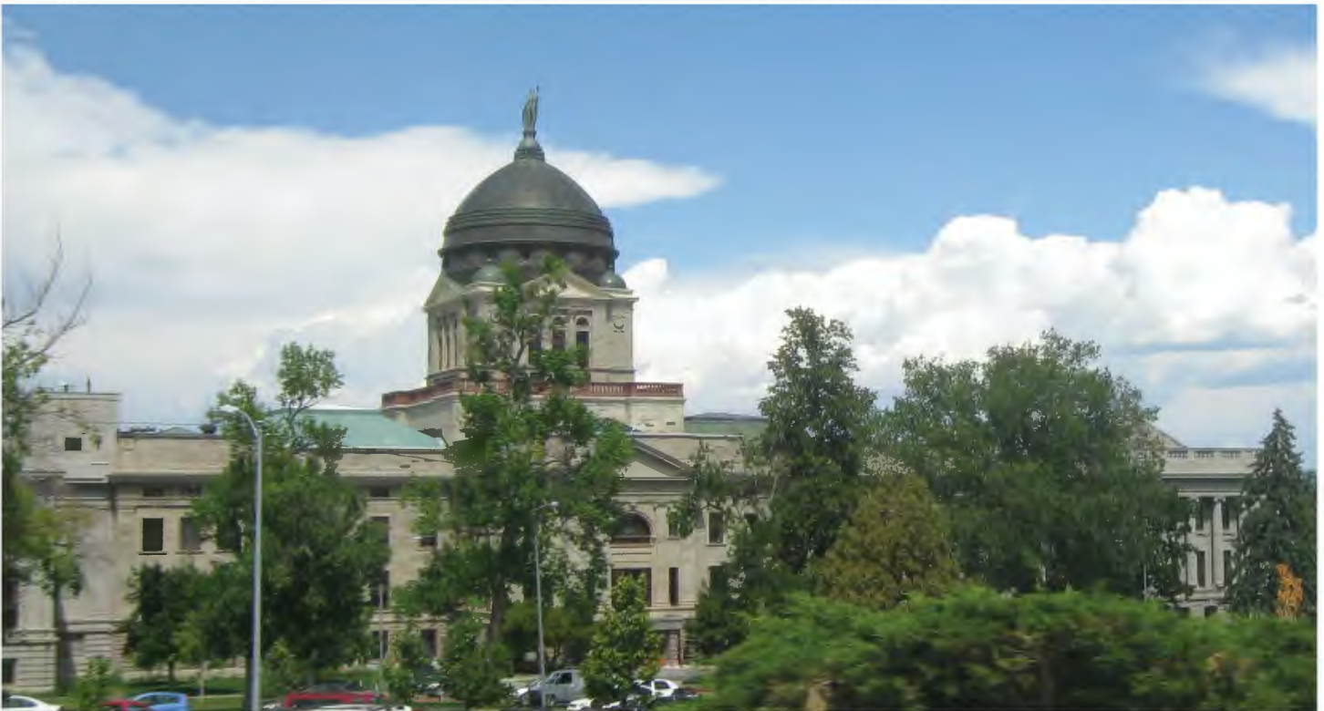
The State Capital Building in Helena.