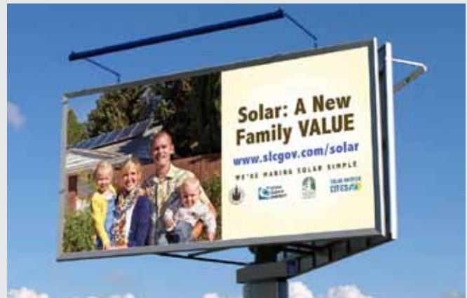
Billboard from the Solar Salt Lake Partnership's solar campaign.